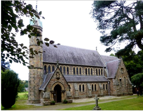
St Margaret's Church, Aberlour

During our recent stay in Moray we were intrigued, while visiting Charlestown of Aberlour (population about 1,000), to see a sign for the local Episcopal Church soon after entering the town. We drove up the 100-yard long tree-lined driveway to find a wonderful 1875 church which was far bigger than any other Episcopal church we have come across. Fortunately we stumbled across a churchyard working group, which meant we were able to enter the church, which would normally have been closed. We were made to feel very